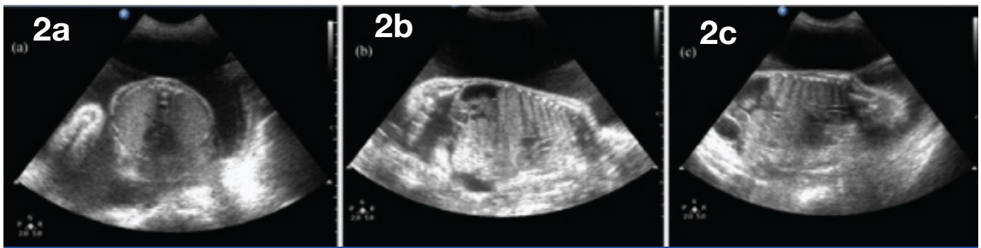
[Table/Fig-2]: (a) Trans-abdominal antenatal ultrasound showing bulky echogenic fetal lungs compressing the heart. Oligohydramnios is not seen but mild polyhydramnios is seen. (b) Trans-abdominal antenatal ultrasound in coronal orientation view showing bulky echogenic lungs compressing the heart. Polyhydramnios is also present. Fetal diaphragm is inverted. (c) Trans-abdominal antenatal ultrasound in coronal orientation view showing dilated trachea with bulky echogenic lungs. Polyhydramnios is also evident.

for establishing fetal airways in CHAOS [6]. CHAOS can be detected on routine ultrasonography due to secondary structural changes like lung enlargement etc. and some cases are detectable as early as 16 weeks [7].